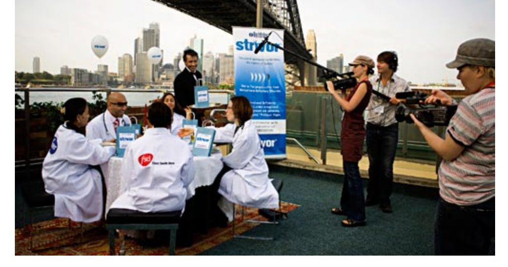
CI staff campaigning against unethical drug promotion in Sydney, Australia

IOCU also increased its work at the International Organization of Standardization (ISO) and the Codex Alimentarius Commission (food standards). as international standards became the reference point for disputes about artificial barriers to trade.