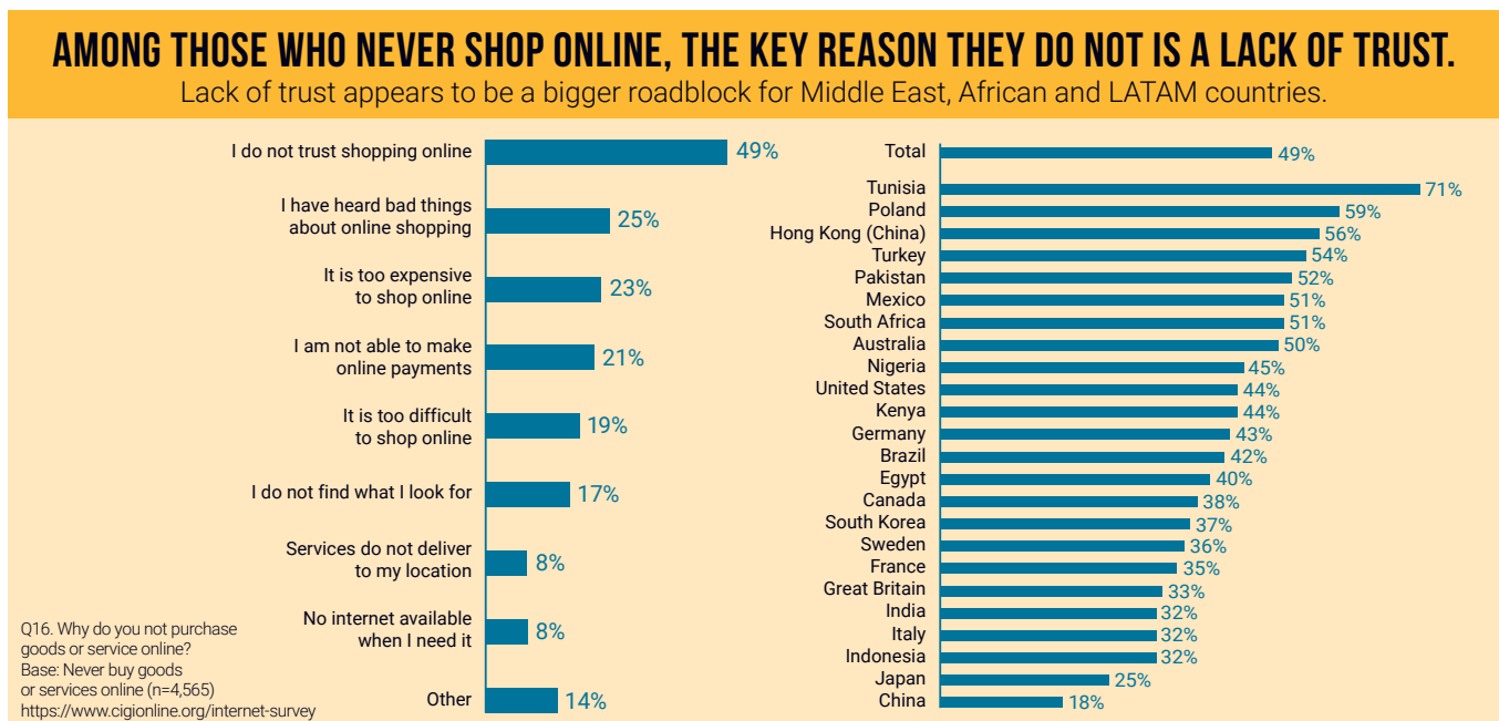
Figure 2: Lack of trust as a barrier to shopping online.

What contributes to this lack of trust? The consumer experience of shopping online is affected by numerous local factors including telecommunications infrastructure, available payment systems, the state of consumer protection, which companies are dominant and more. It is possible however, to identify some common issues that consumers encounter that can make them unable or reluctant to shop online. These range from unclear and confusing business practices to outright scams and cybercrime. Lack of redress when things go wrong can also undermine trust.