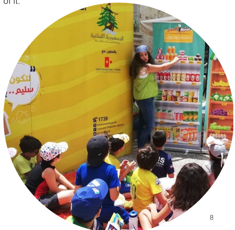
Consumer Protection Lebanon

Market research or mystery shopping is sometimes used to understand the market from a consumer's point of view. Consumer organisations also work as knowledge brokers, collating evidence produced by others and making sure that policy makers are aware of it.